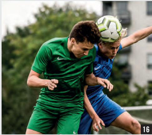
NEW CHALLENGE III