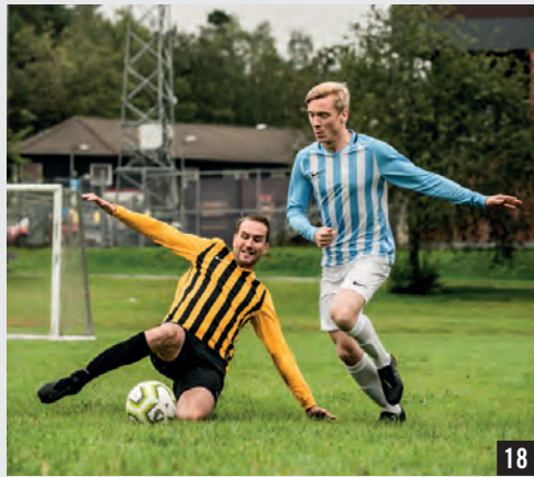
STRIPED DIVISION III