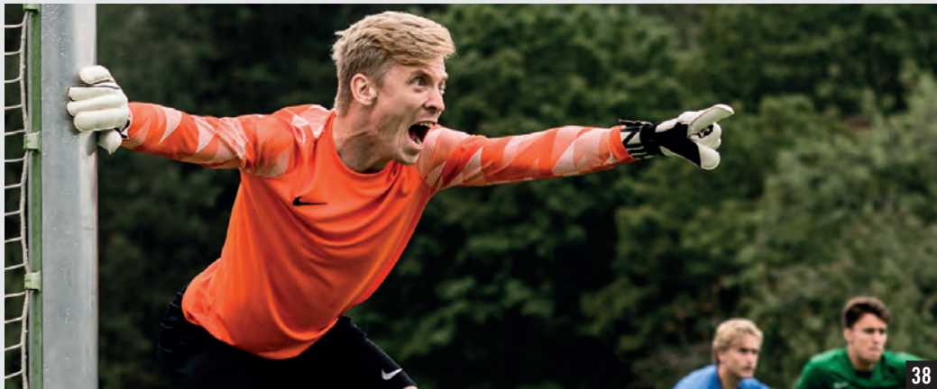
NEW GARDIEN III