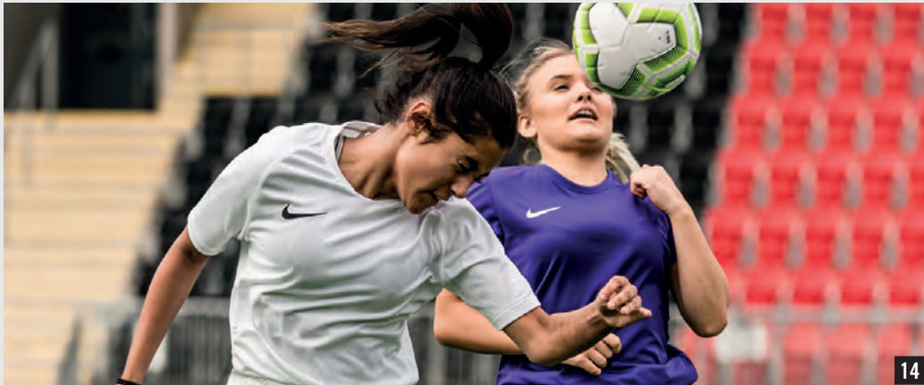
NEW WOMEN'S STRIKE