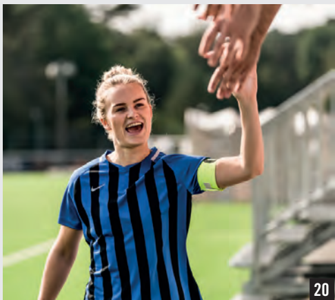
NEW WOMEN'S STRIPED DIVISION III